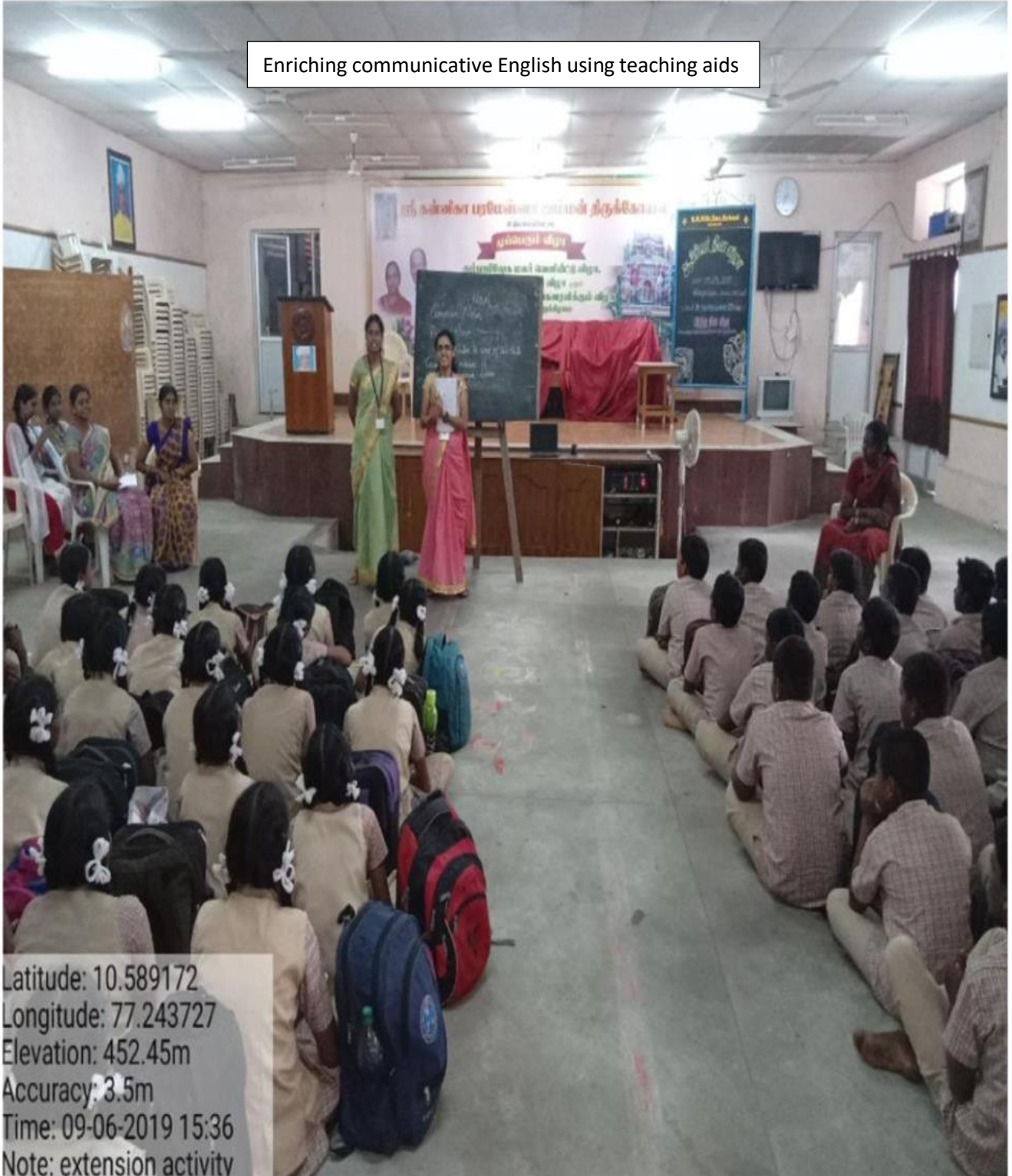
Enriching communicative English using teaching aids

Latitude: 10.589172 Longitude: 77.243727 Elevation: 452.45m Accuracy: 3.5m Time: 09-06-2019 15:36 Note: extension activity